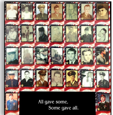
Gold Star Veterans Honor Wall