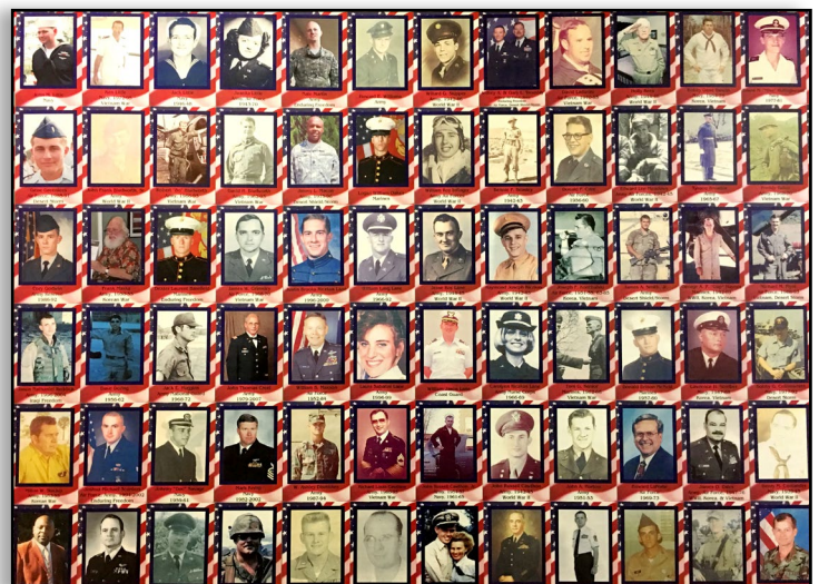
A small portion of the Veterans Honor Wall