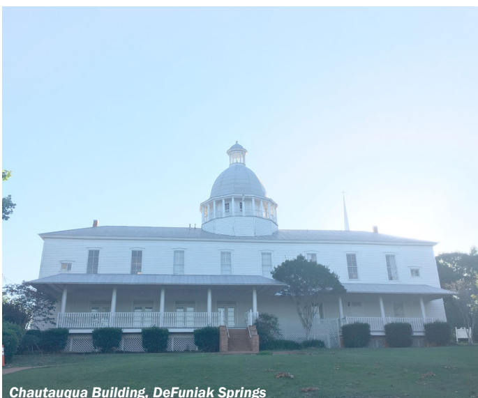
Chautauqua Building, DeFuniak Springs