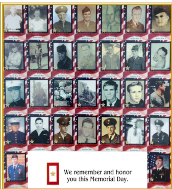
Gold Star Veterans Wall - Walton County Courthouse