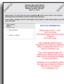
Visit our website for a Sample Ballot